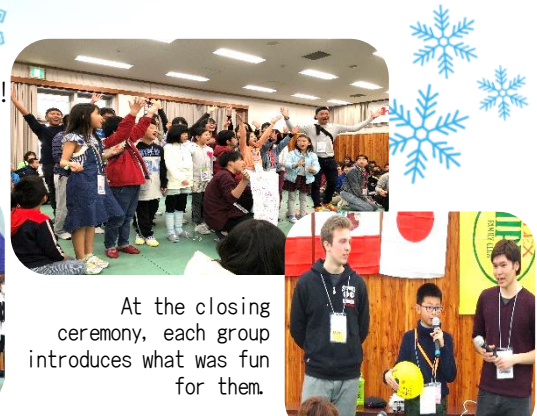
Let's share the day's activities