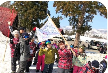
First, let's make the group flag, it will inspire teamwork!