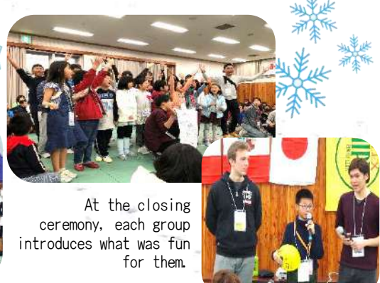
Let's share the day's activities