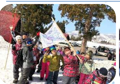
First, let's make the group flag,