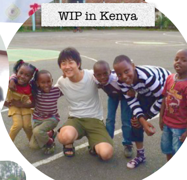
WIP in Kenya