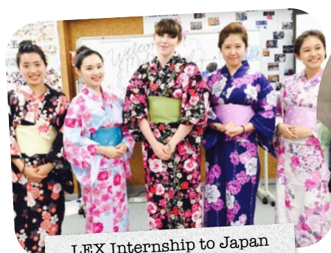
LEX Internship to Japan