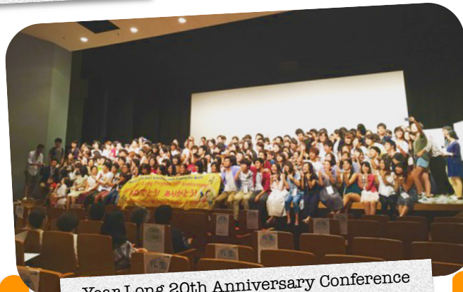
Year Long 20th Anniversary Conference